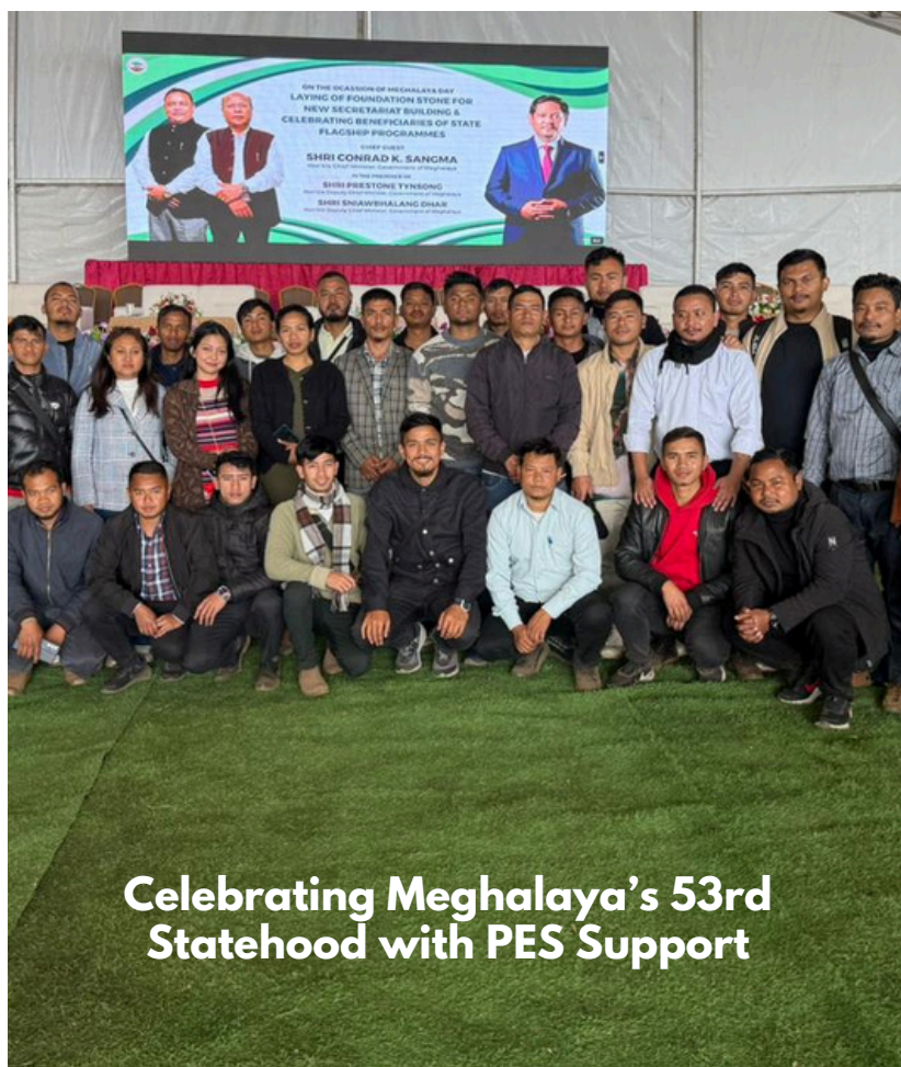
Celebrating Meghalaya's 53rd Statehood with PES Support